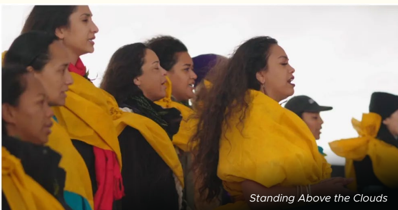
Standing Above the Clouds

Download this month's promotional assets to support conversation!