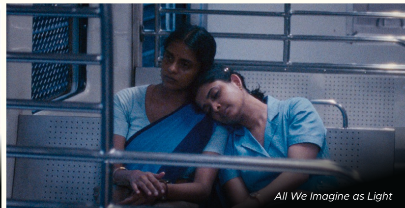
All We Imagine as Light